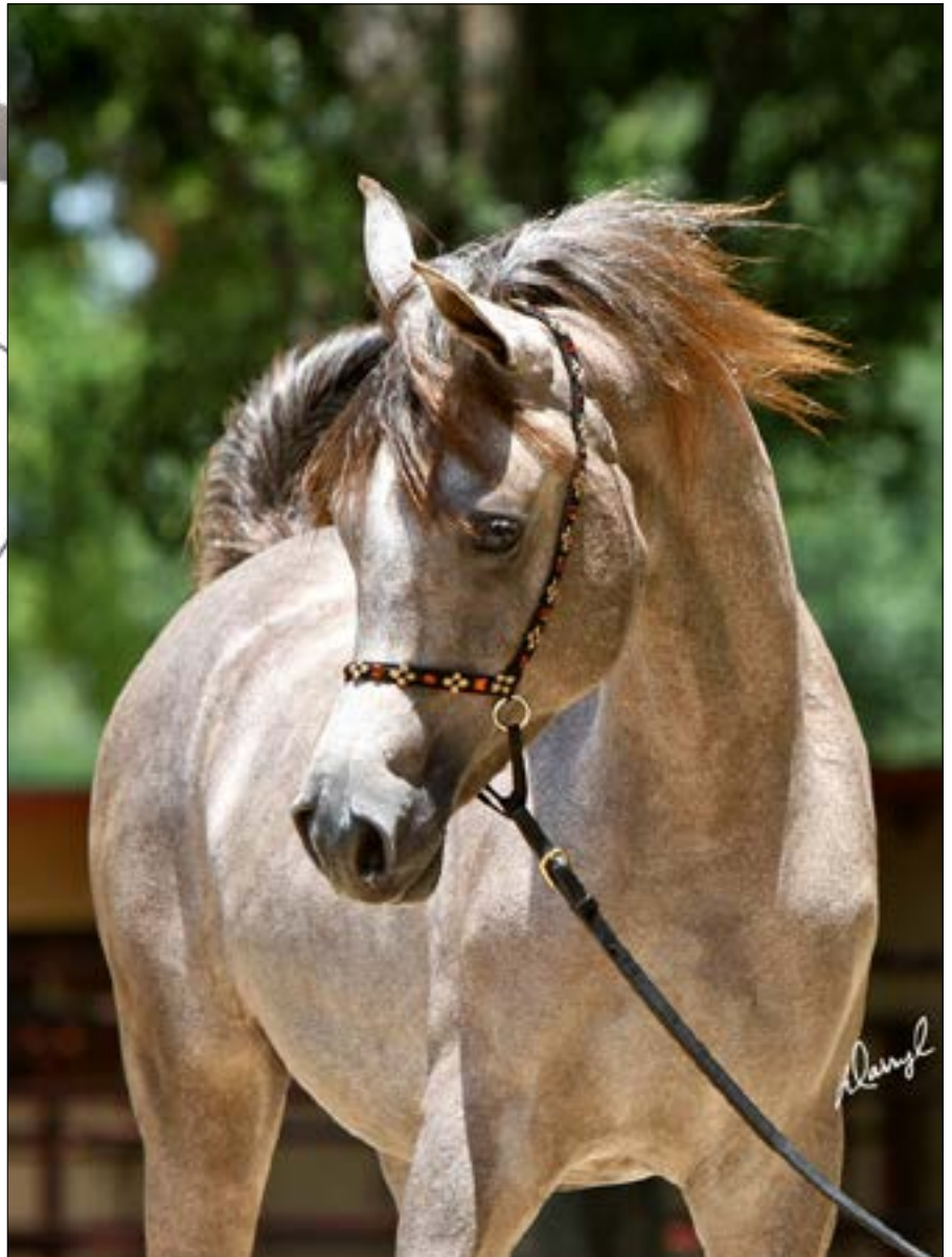
Marajh KA at 10 months old.

Marajh KA from a young age always resembled the classic look of the desert Arabian, a combination on type, great