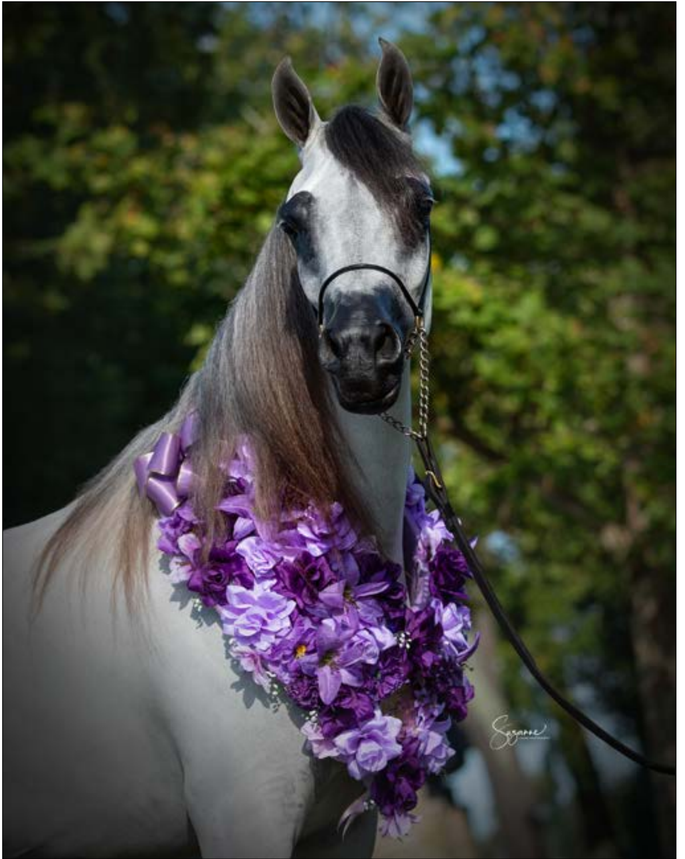
AJS Sigi Belle