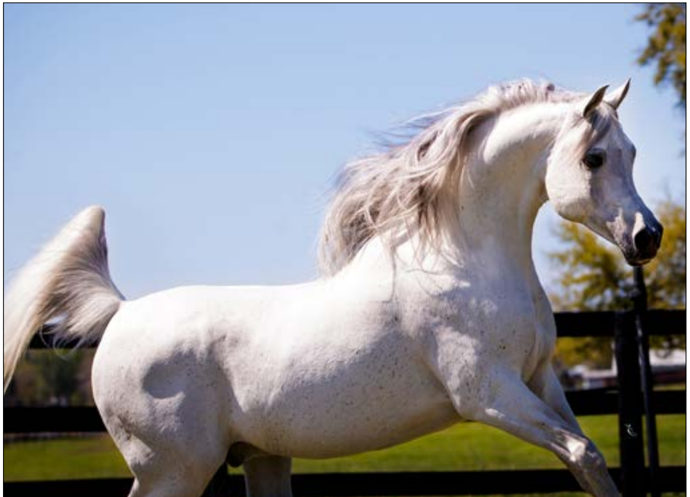
Marajh KA (Makbnificent KA x Marquisah KA) 2008 Grey Straight Egyptian Stallion